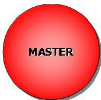
"Master" Metadata Describes the Media Asset Itself — Either a physical master (like a videotape or film reel) or a digital asset stored in a DAM

A master in MetaVault Library is metadata that describes an actual media element. For example, a videotape has a video format, a size, a weight, a location, and a movement history. All of this metadata is stored in a master record in MetaVault Library.